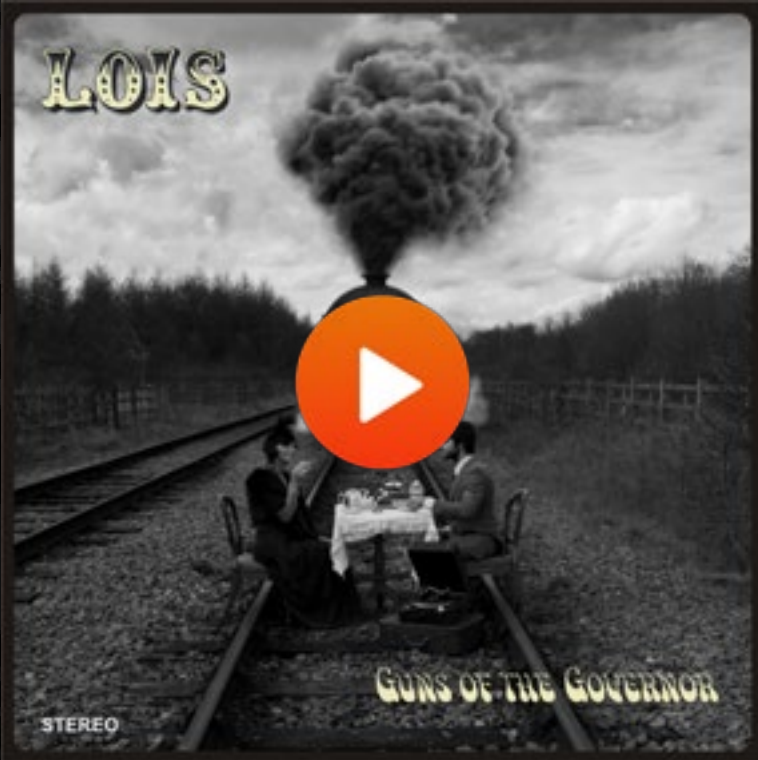
GUNS OF THE GOVERNOR