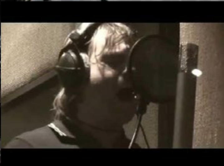
BE TRUE TO YOURSELF