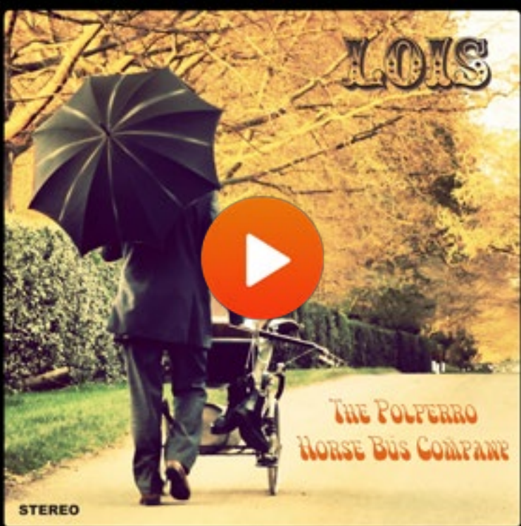
THE POLPERRO HORSE BUS COMPANY