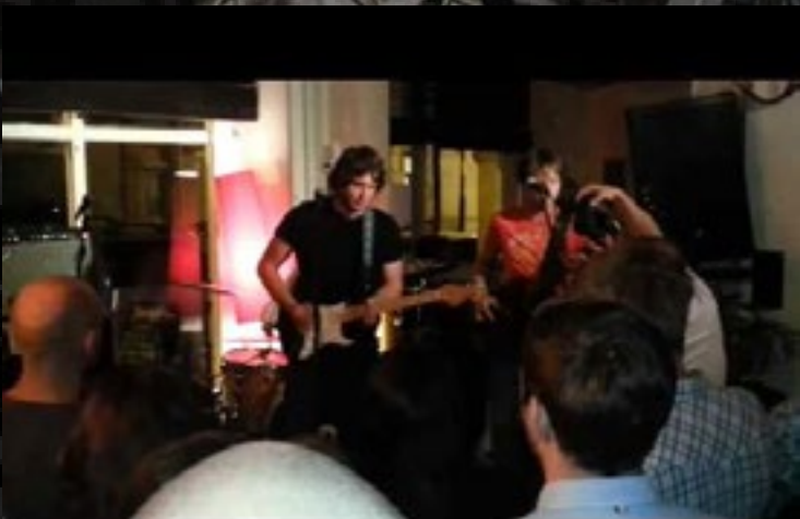
I'M OUT FOR THE SUMMER (live)